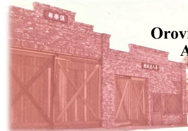
Oroville's Two Chinatowns And the Lava Beds