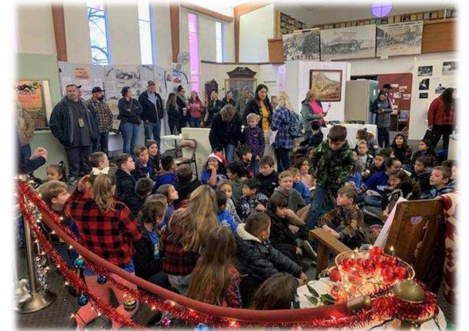
Students and chaperones prepared for The Polar Express

Their generous donation of time and displays made this event a success!