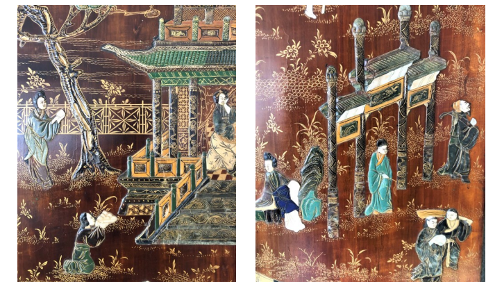
Top: Six panel Oriental screen at its former Ehmann Home location. It will soon be the centerpiece of a new Asian Culture display at the BCHS History Center