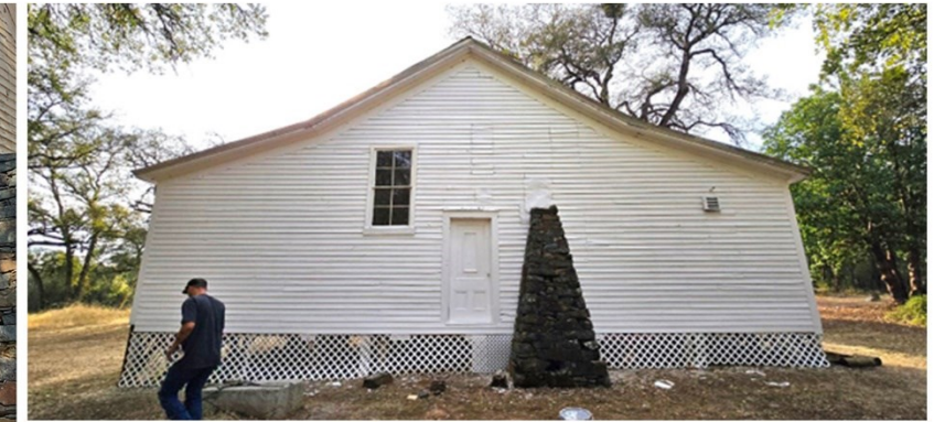
Sarah Mauch and Lane Owen scraping and painting the back wall of the old schoolhouse