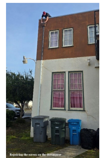
New gutters for the Ehmann Home, now she's waiting for her new sign. There is still more to be done!

We gratefully accept donations! www.buttecountyhistory.com