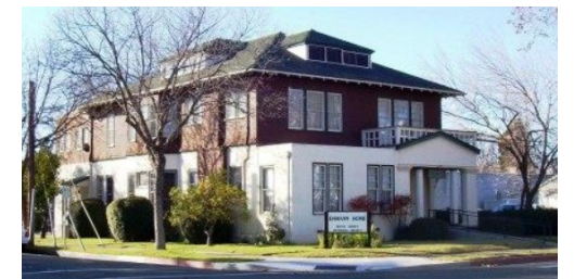
The Ehmann Home

This book is an attempt to reconstruct the history of the Yahi Indians of Northern California, a history the author feels was mangled by a common infatuation with the myths surrounding Ishi, the last survivor of the tribe. The focus on Ishi has allowed the Yahi's remarkable adaptation to a hostile environment to be ignored. And the facts of the destruction of the tribe have been replaced with yarns which have been widely accepted, even though in the author's view, they don't make any sense.